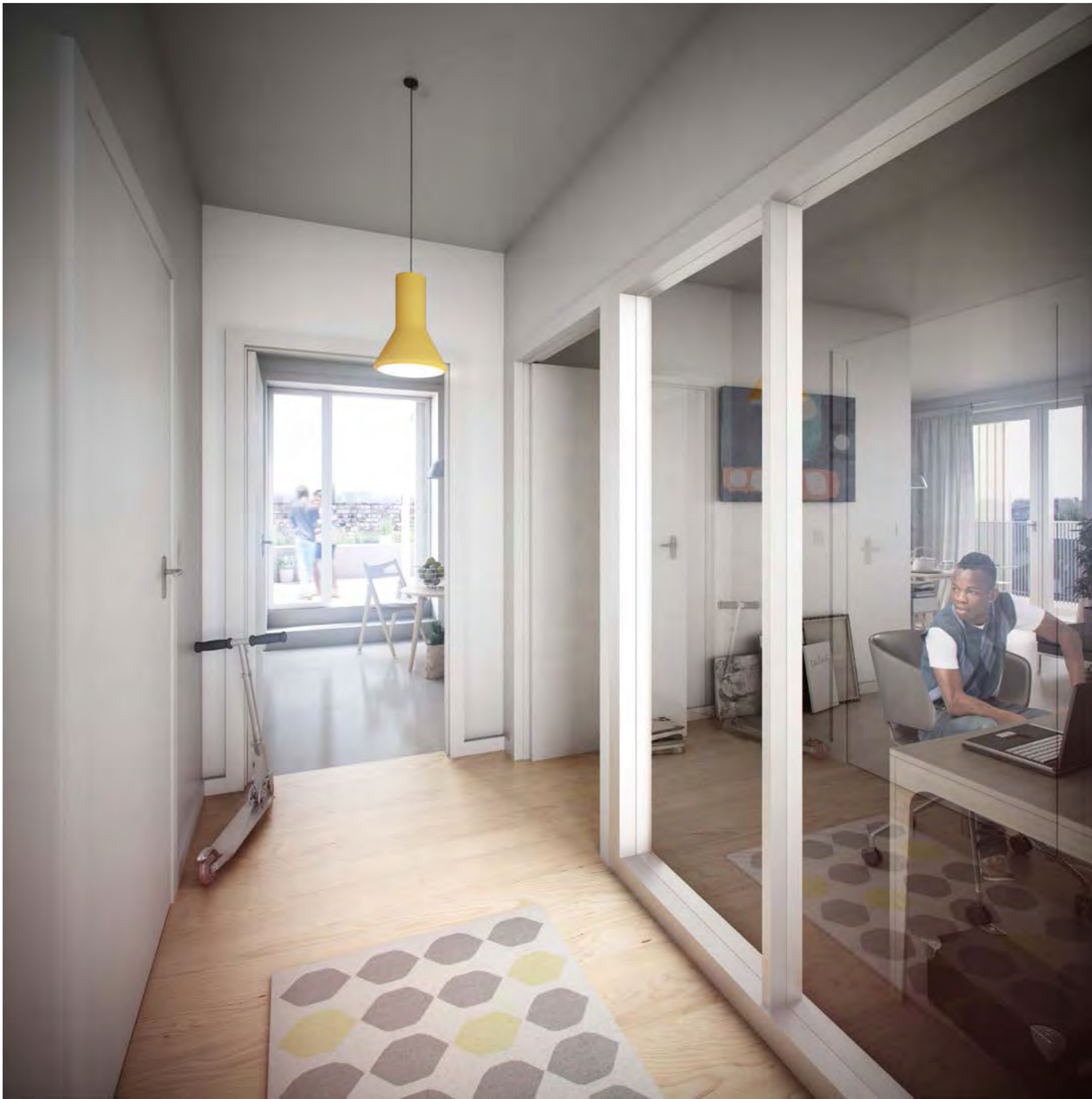
This image shows the hallway of a typical 2 or 3 bed flat in Block A, viewed from the flat entrance door