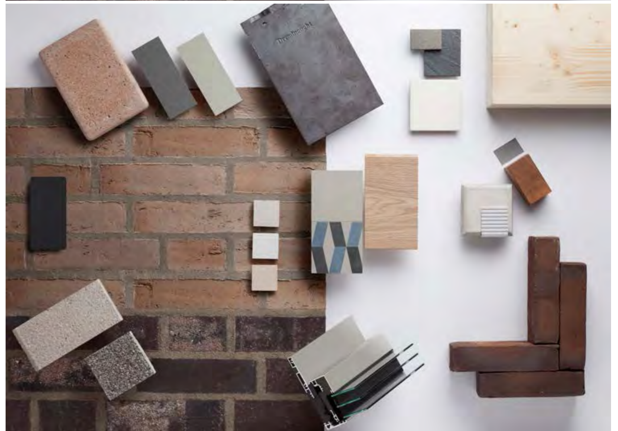
Sample board Block F & H