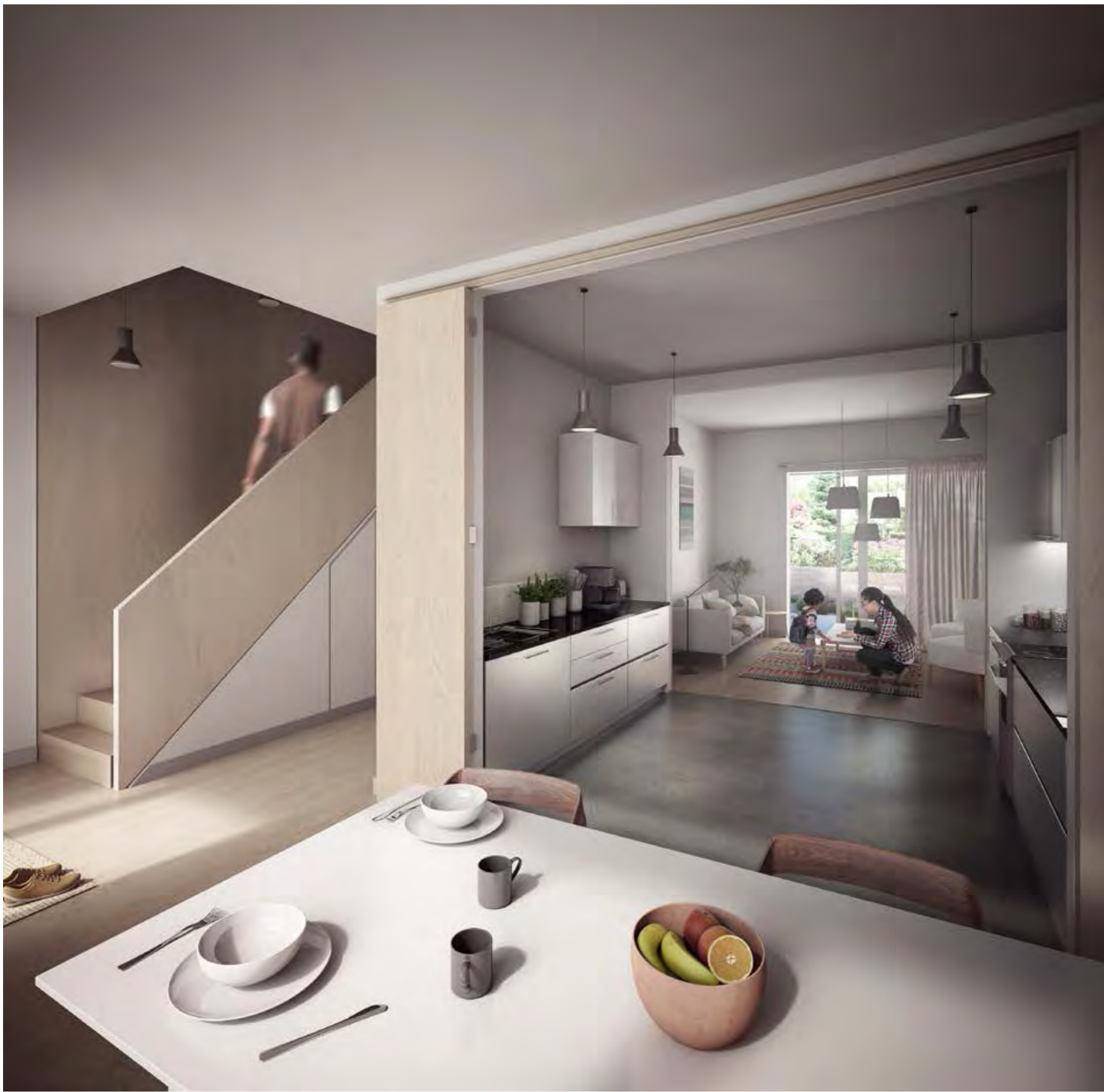
This image shows the ground floor of a typical 3 or 4 bed maisonette in Block F