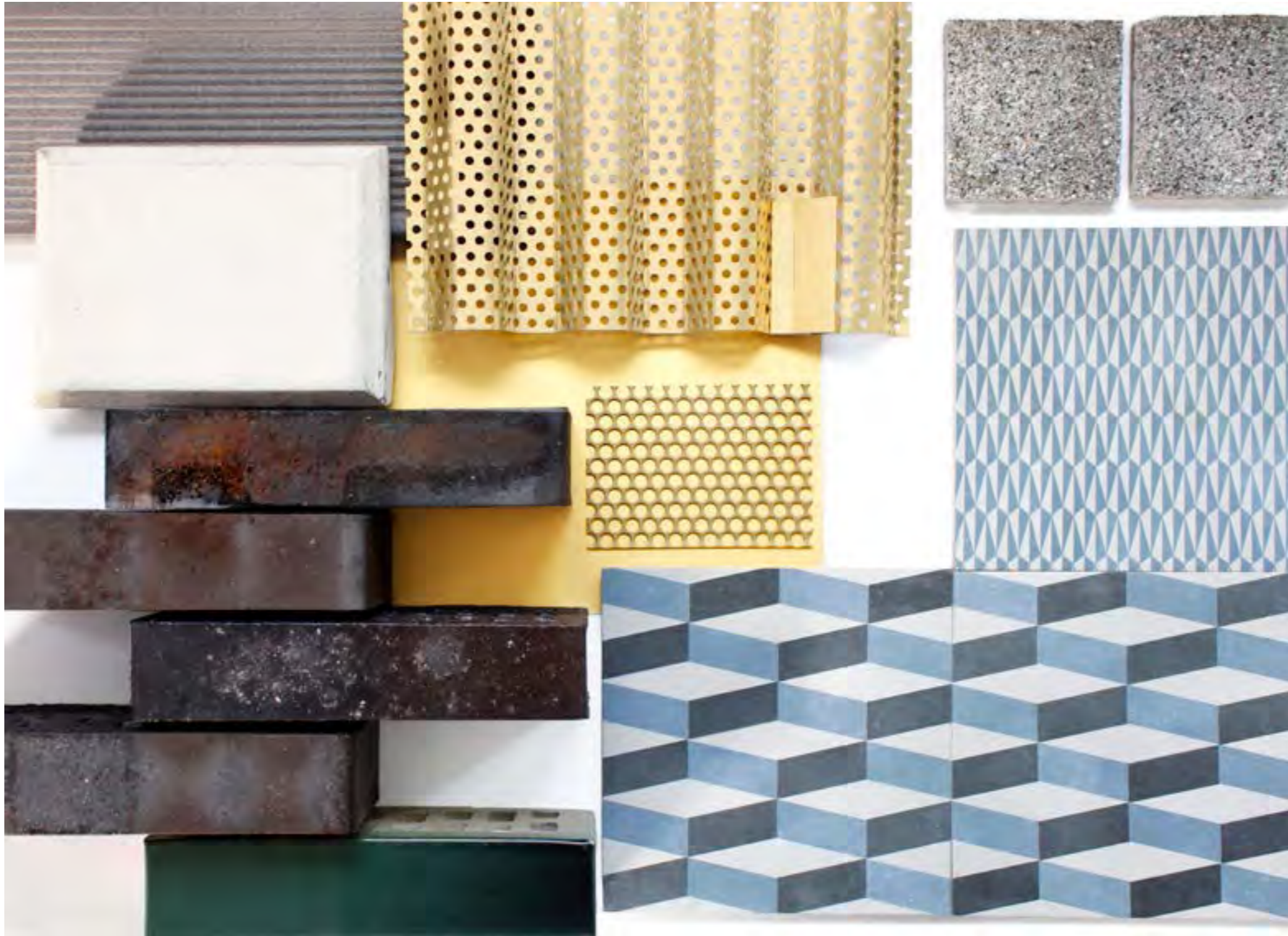
Sample board Block A

Many residents have been asking about the types and quality of materials that we will be providing both inside and outside the home. Below are some sample boards which should give you an idea of the level of quality we are aiming for. The final selection of some of the materials may change during the tender process but we will provide a similar level of quality.