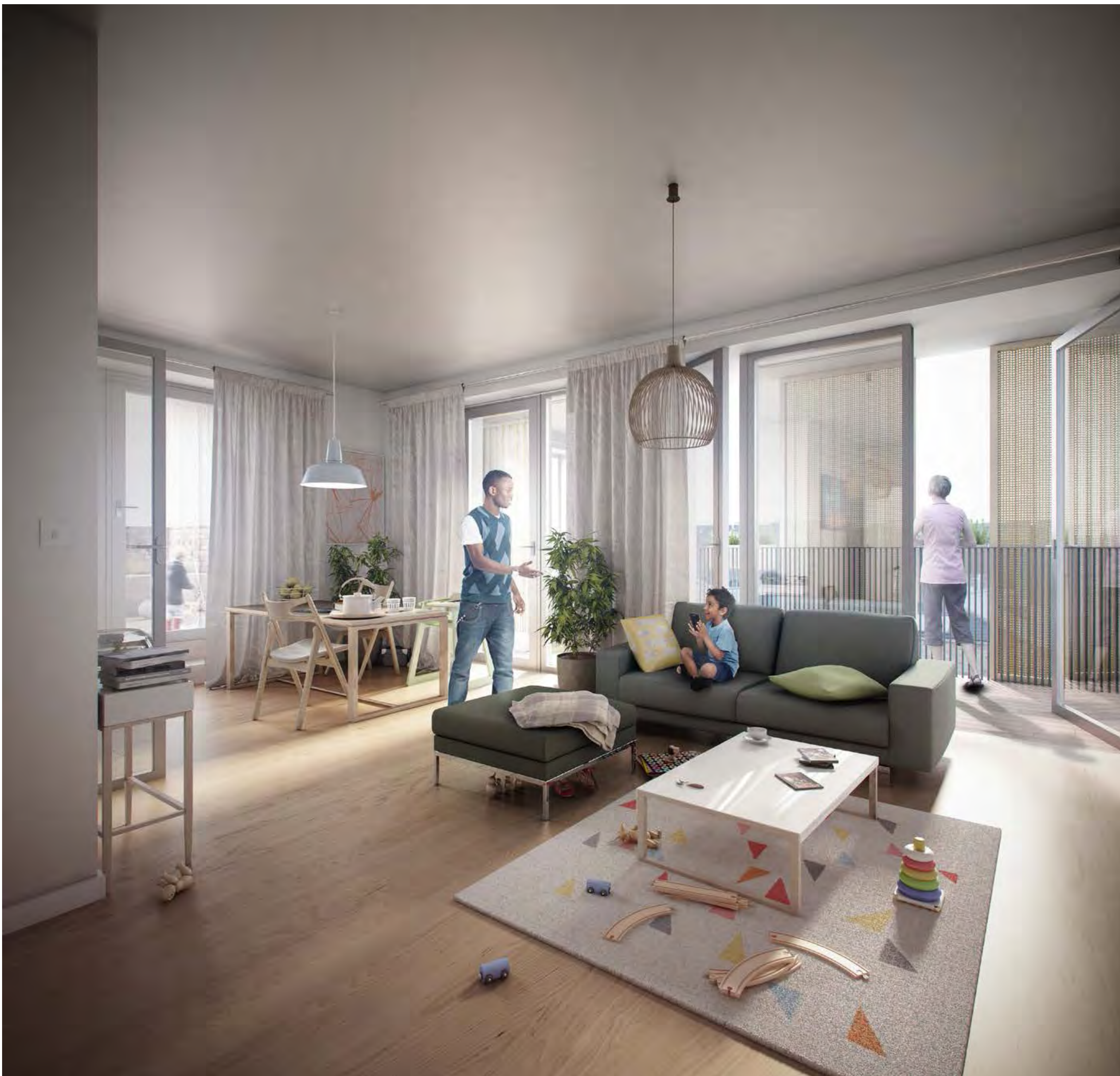
Image of the living / dining area of a single storey 2 or 3 bed flat in Block A

The image below and those on the next two boards are CGIs (computer generated images) to show you the internal specification of the maisonettes and flats in the first two phases of the development. As mentioned above, some of what is shown may be subject to change but the images should give you an idea of the level of quality we are aiming for. We will be providing timber effect vinyl flooring in all of the living areas, vinyl / rubber flooring in kitchens and bathrooms, an integrated oven, hob and hood in the kitchen as well as curtains or blinds throughout. But please note furniture, lighting shades and other fittings will not be included in the new homes.