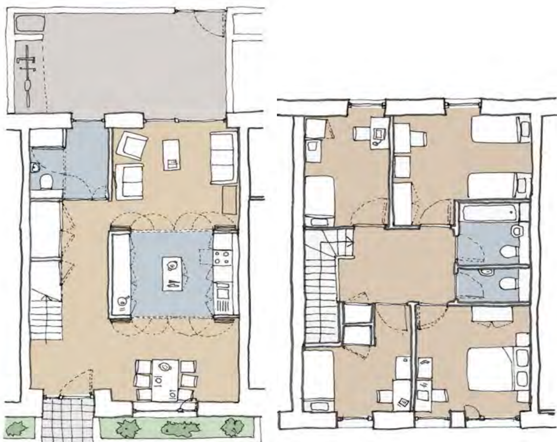
Block F: typical 4 bed maisonette - ground and first floor plans