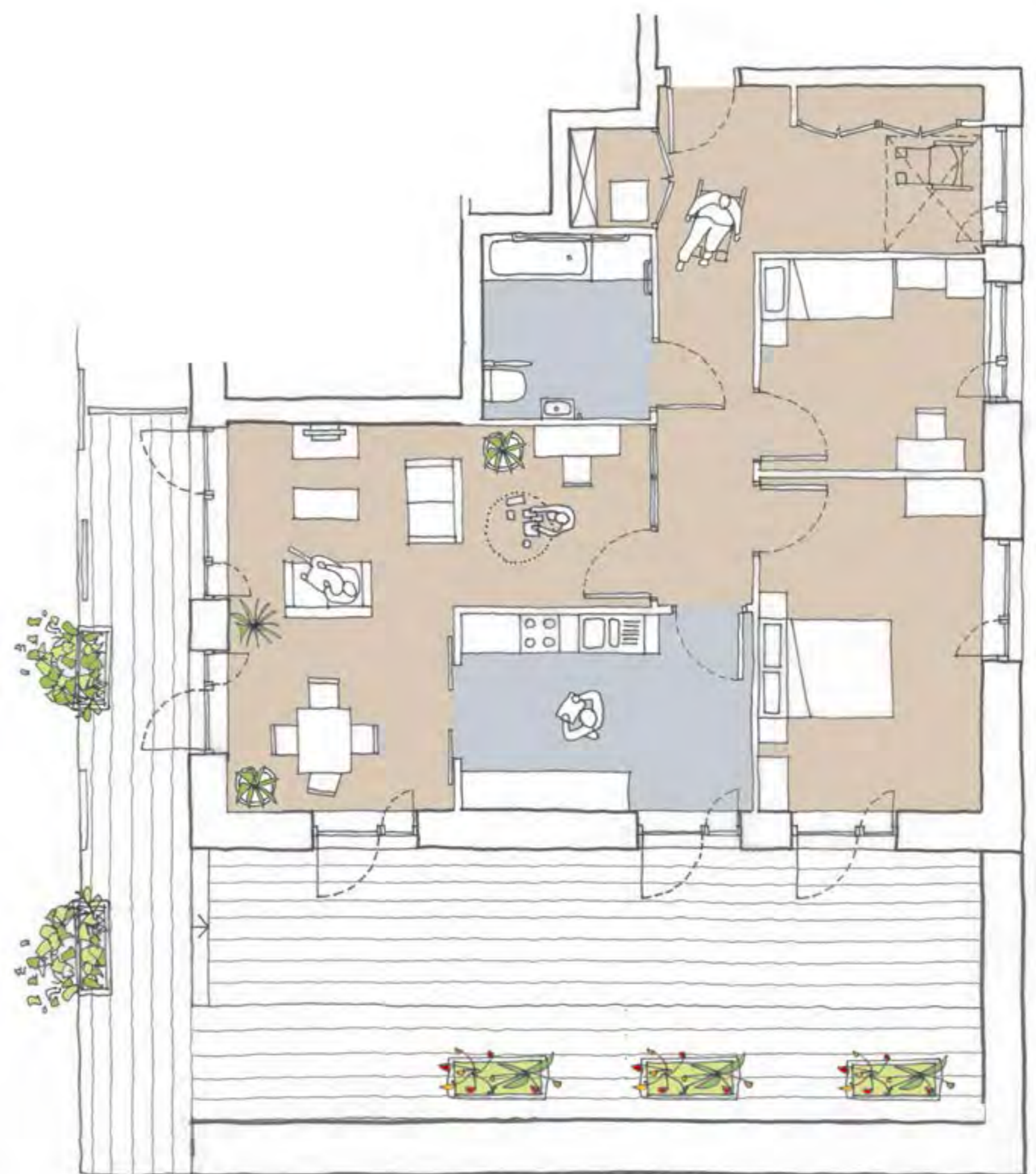
Block A: '2 bed 3 person' wheelchair user's flat - floor plan