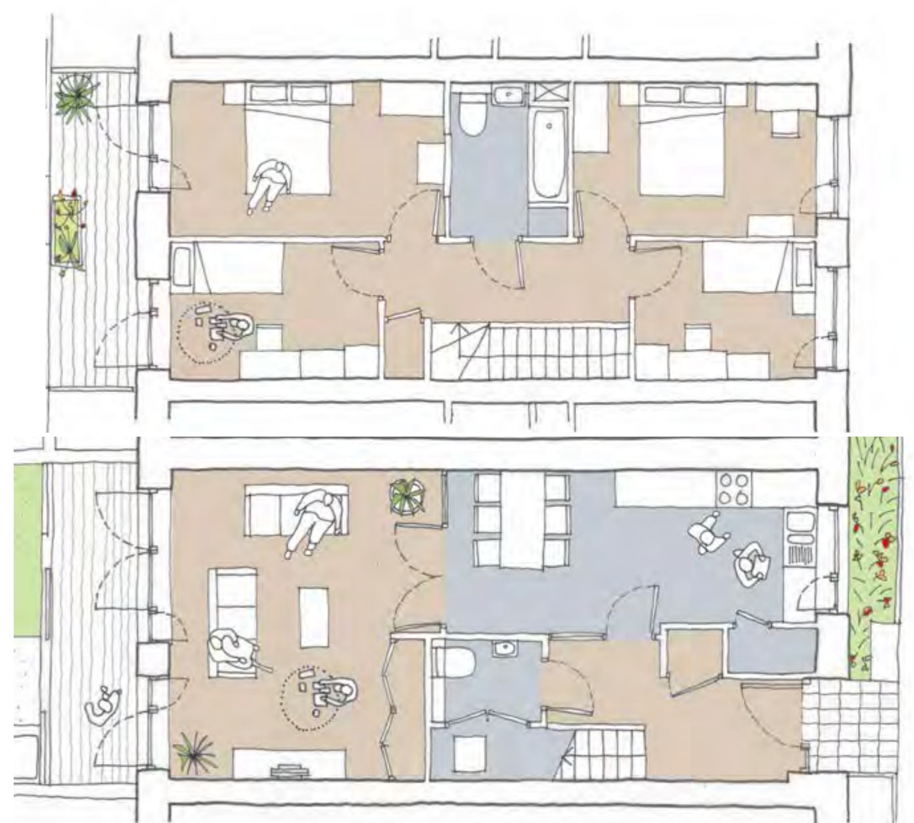
Block A: typical 4 bed maisonette - ground and first floor plans