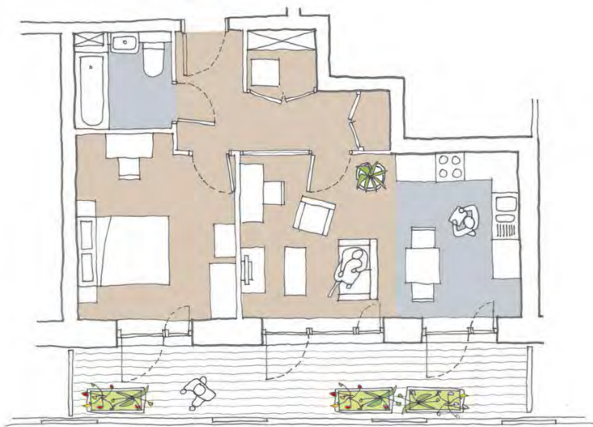
Block A: typical 1 bed flat - floor plan