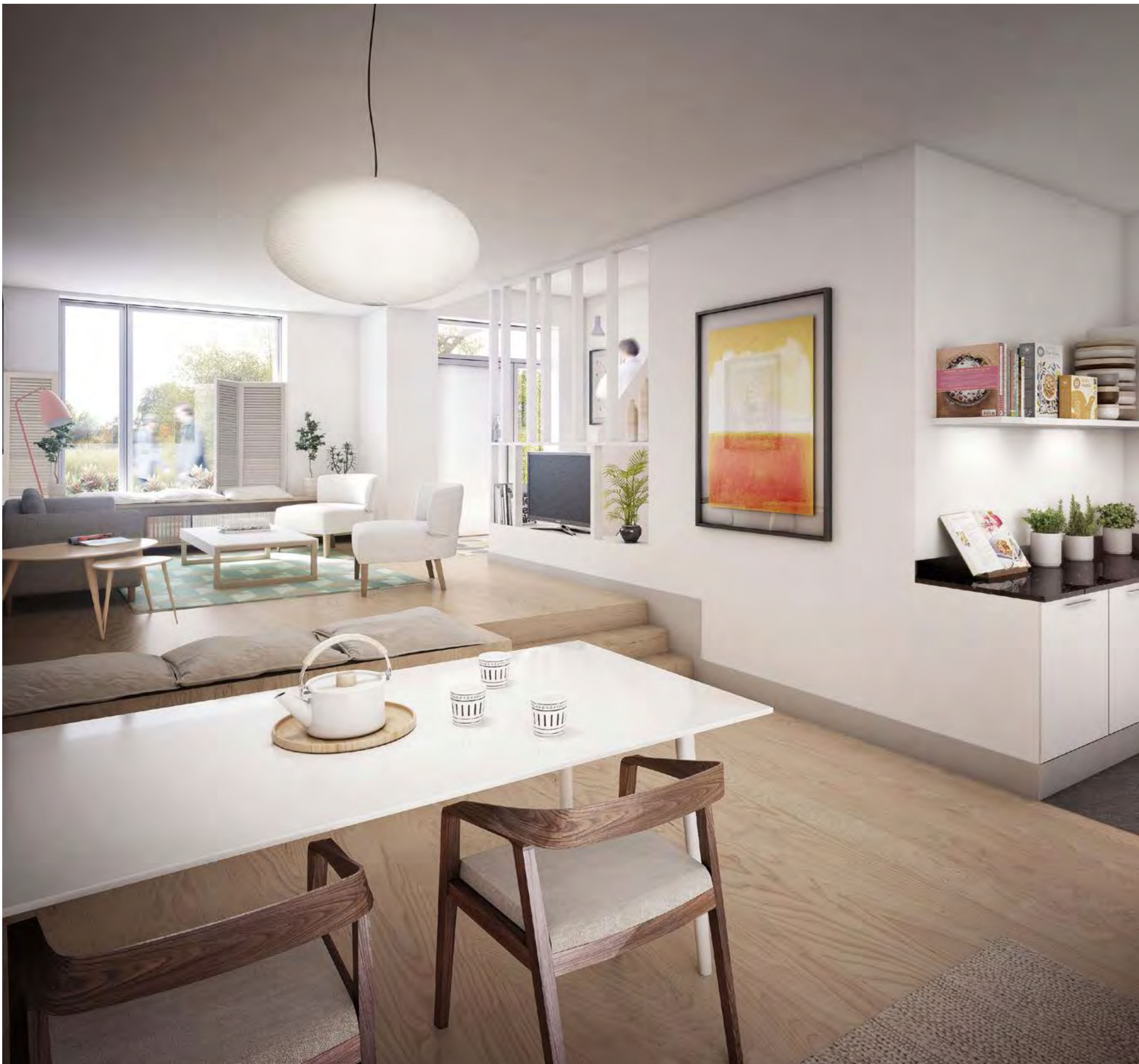
This image shows the ground floor of a typical 4 bed maisonette in Block H