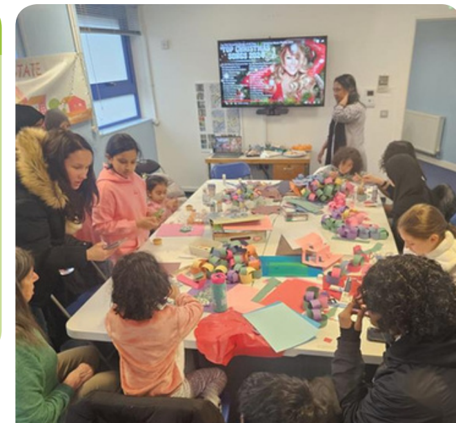
RESIDENTS TAKING PART IN FESTIVE ACTIVITIES AT OUR CHRISTMAS WORKSHOP

Please note, Camden officers will carry badges when they visit you to identify themselves, please ask to see ID if you are unsure. This applies to all visitors.