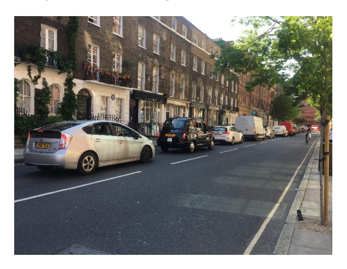
b) Judd Street congested