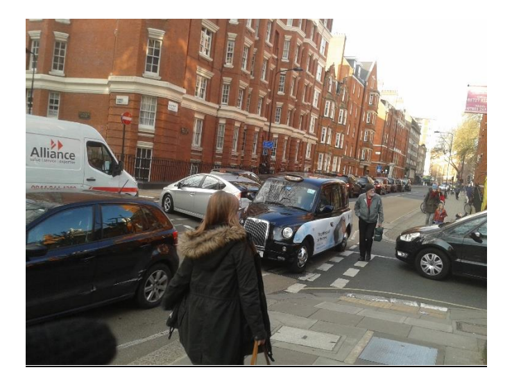
d)Hunter Street congested up to Brunswick square