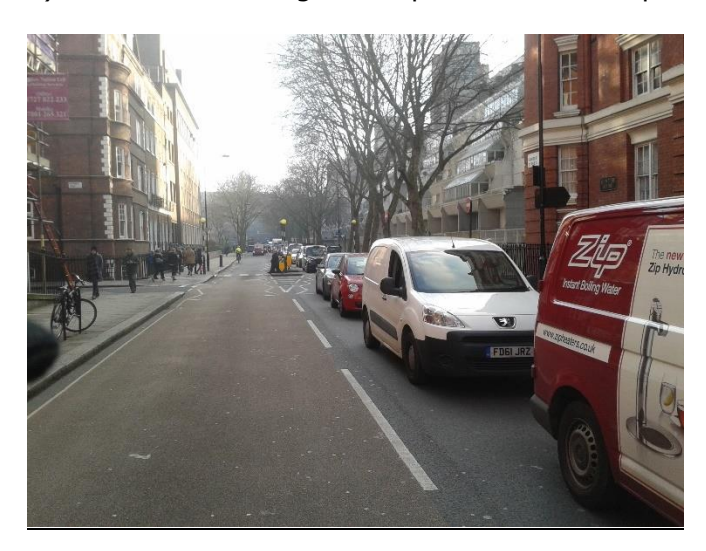
e)Tavistock Place empty of cars and cycles