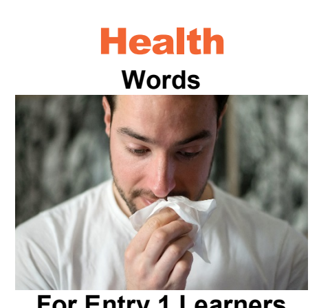
For Entry 1 Learners