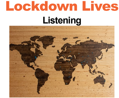
For Level 1 to Level 2 Learners